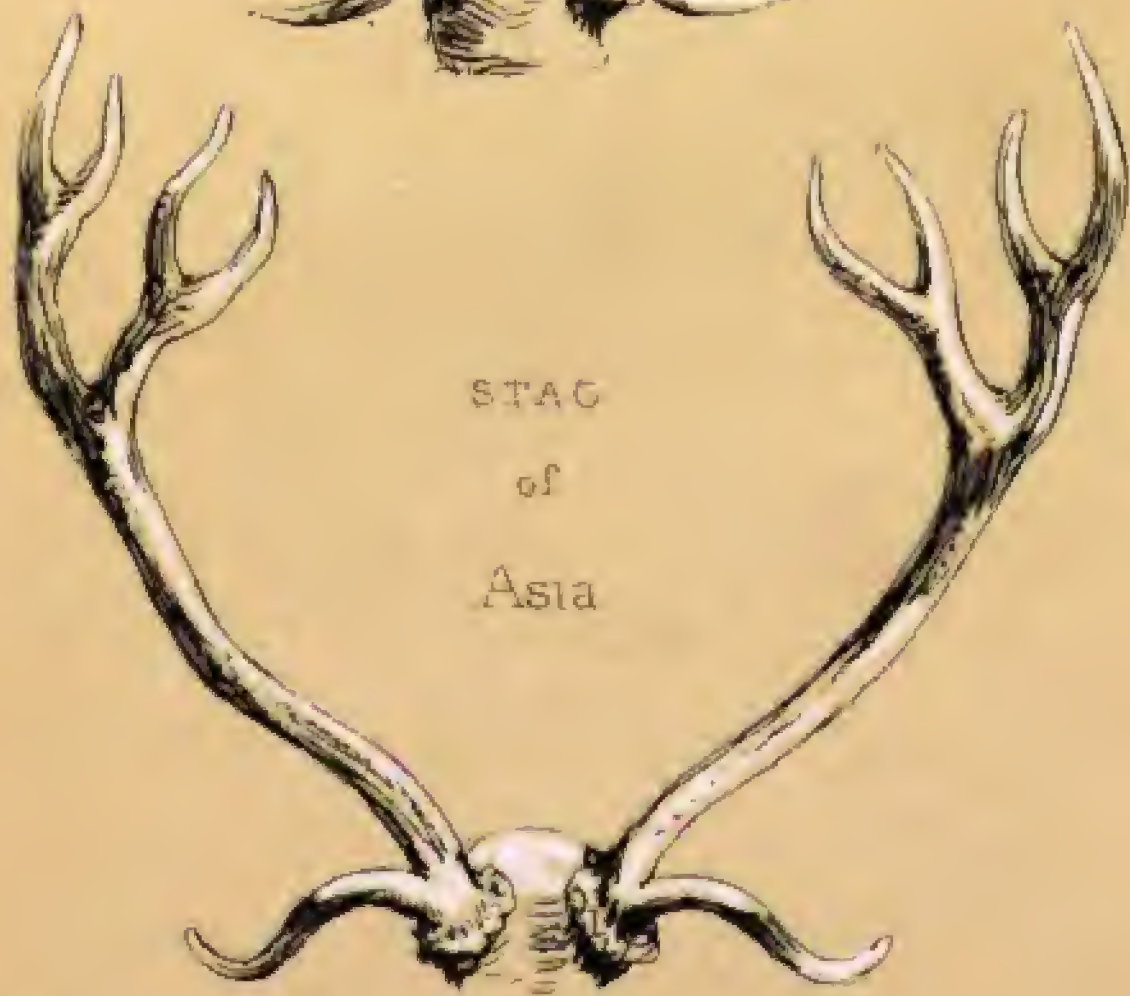
STAG of Asia